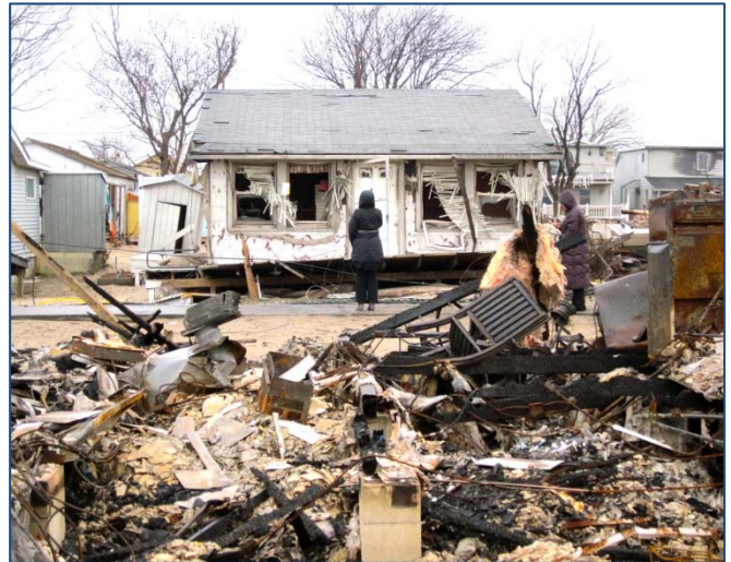
Hurricane Sandy - Breezy Point, NY

ATSDR's Geospatial Research, Analysis & Services Program (GRASP) has created a tool to help emergency response planners and public health officials identify and map the communities that will most likely need support before, during, and after a hazardous event.